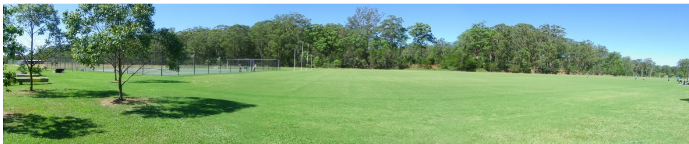
St Josephs Regional College sports-fields.