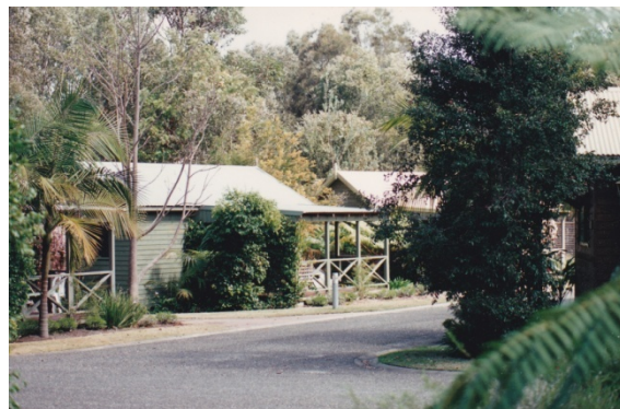
Rainbow Beach Resort.