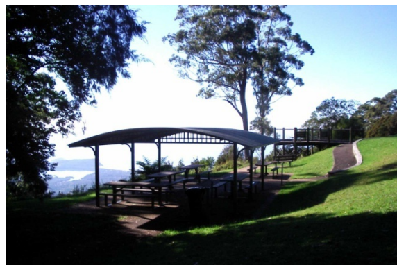
Dooragan National Park.